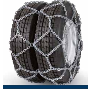
pewag austro super reinforced twin